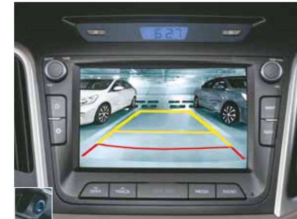
Rear Parking Assist System