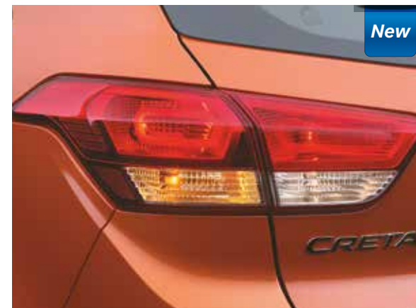
Stylish Split LED Tail Lamps