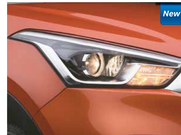
Bi-functional Projector Headlamps