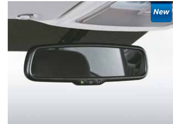
Electrochromic Mirror (ECM)

Seat Belt Pretensioner-Driver & Passenger Side | Reverse Parking Sensors (Standard) | Speed Sensing Auto Door Lock (Standard) Impact Sensing Auto Door Unlock | Cornering Lamp | ISOFIX | Speed Alert System