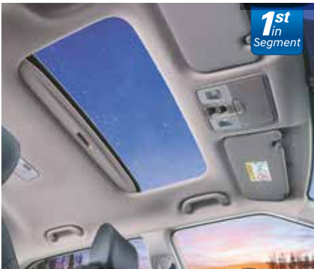
Smart Electric Sunroof