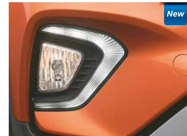
LED DRL & Positioning Lamp

Shark Fin Antenna | Chrome Finish Outside Door Handles | Sporty Dual Tone Exterior Colours LED Turn Indicator on ORVMs | Side Body Cladding