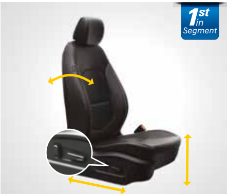
6 Way Power Driver Seat