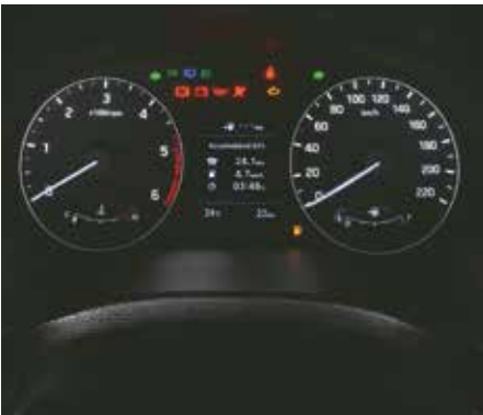
Advanced Supervision Cluster