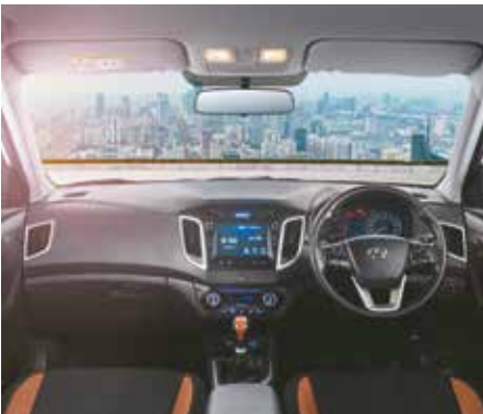
Sporty Interior Colour Pack *

Leather Seats** | Rear AC Vent | Smart Key with Push Button Start | Sunglass Holder | Door Scuff Plates | Rear Centre Armrest with Cupholder Electrically Adjustable ORVM with Turn Indicators | 60:40 Split Rear Seats# | Luggage Net & Hook | Storage Space in Console Armrest | FATC with Cluster Ionizer | Eco Coating Technology