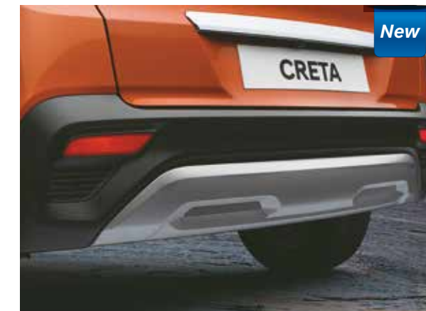
Bold Front & Rear Skid Plates