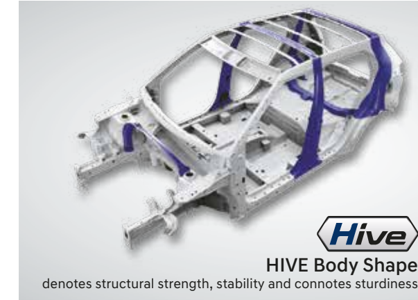
HIVE HIVE Body Shape denotes structural strength, stability and connotes sturdiness