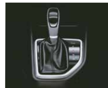
6-speed Automatic Transmission in Petrol & Diesel Variants

Feel the surge of power as you discover the roar of its Petrol and Diesel engines.