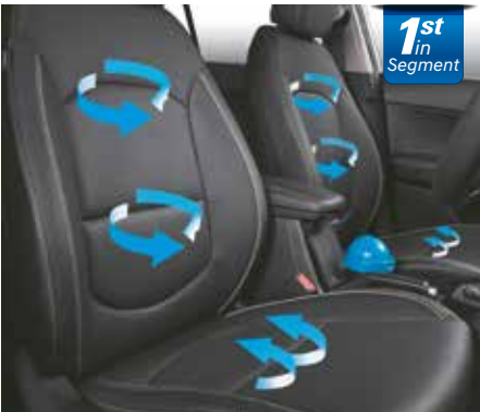
Front Ventilated Seats