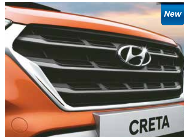
Bold Cascade Design Front Grille

Designed to turn heads as effortlessly as it turns corners, the CRETA is crafted beyond perfection. Based on Hyundai's evolved Fluidic Sculpture 2.0 design concept, it always arrives in style and leaves a strong impression.