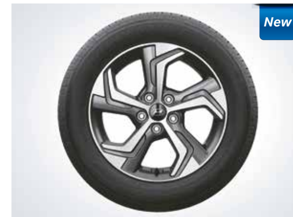
R17 Diamond Cut Alloys